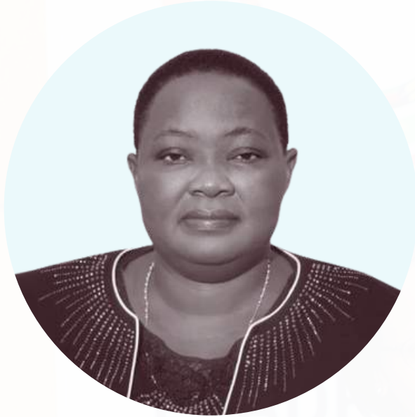
Rt. Hon. Robinah Nabbanja

Prime Minister of the Republic of Uganda and Leader of Government Business in Parliament