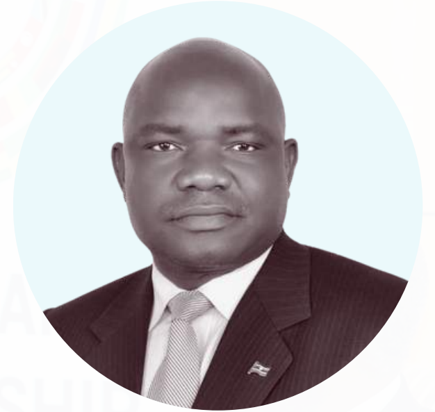
Hon. Biyika Songa Lawrence

Chairperson of the Parliamentary Committee on Environment and Natural Resources – Uganda